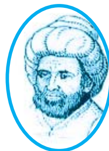
Muhammad ibn Musa al-Khwarizmi (A.D. 780 – 850)

A lemma is a proven statement used for proving another statement.